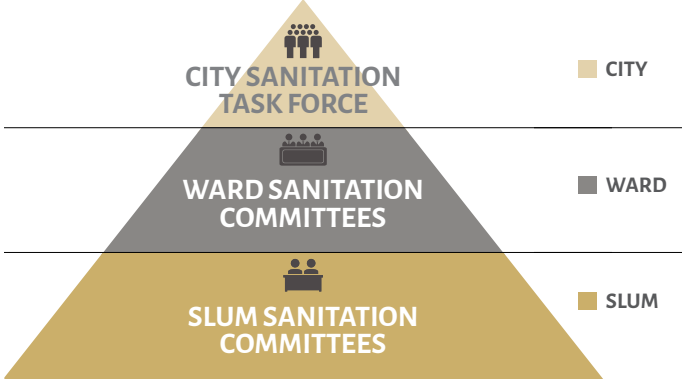
Figure 1: Three tier community engagement structure implemented under Project Nirmal in Angul and Dhenkanal

A three-tier structure for community engagement has been put in place at the slum, ward and city level in Angul and Dhenkanal Municipalities. (Figure 1) While the slum level institutions, that is, the Slum Sanitation Committees (SSCs), aren't a part of the formal urban governance structure the institutions at the ward and city level, namely, the Ward Sanitation Committees (WSCs) and the City Sanitation Task Force (CSTF) have been constituted under the provisions of the Odisha Urban Sanitation Policy (2017) and the Odisha Urban Sanitation Strategy (2017).