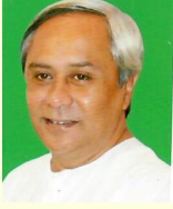
NAVEEN PATNAIK CHIEF MINISTER, ODISHA